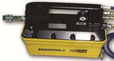
Hydraulic / Pneumatic pump equipped with "remote" footswitch.