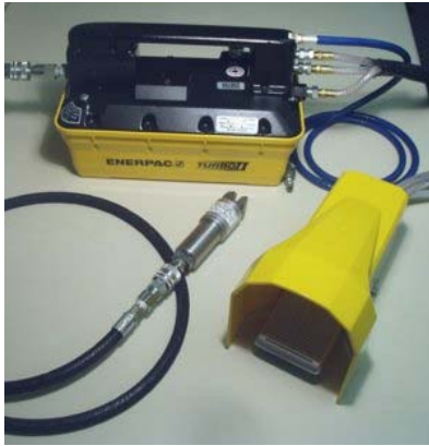
Scissor-style handset & jaws with hydraulic / pneumatic pump and remote footswitch.