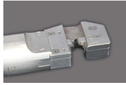
C-style handset with parallel action jaw set. Teamed with hydraulic pump (not shown). Custom build-to-order tool.

Hydraulic pinch-off tools are available in a variety of sizes and styles, configured with a variety of hydraulic pumps, depending upon the application.