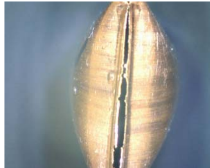
Example of tubing that was too hard and separated prematurely during the pinch-off process.

The tubing most commonly used for mechanical pinch-offs is OFHC (Oxygen Free High Conductivity) Copper. The specifications, chemistry and state of ductility for billet certified (99.9% pure) Copper is detailed in ASTM specs B68-83, B75-84, B133-33 and B170-82. Other approved and commonly used materials include: High purity Nickel ("A" Nickel, NI 270, NI 200 or 99.4% pure Nickel ASTM-B161), Aluminum (annealed 3003 H14, 98% classified non-heat treatable), pure Iron, Gold, Platinum, Silver, and Columbium.