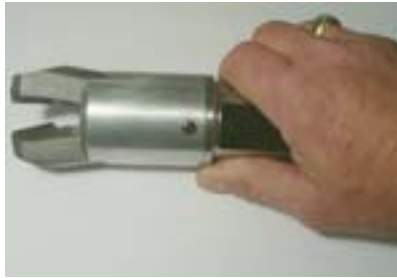
Handset with scissor style, 45° angled jaw for use on 3/8 -1/2" diameter tubing.