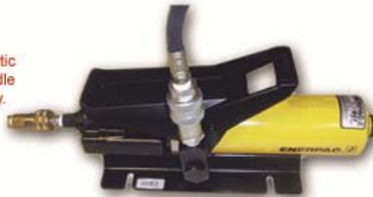
Standard Hydraulic / Pneumatic Pump with foot-actuated peddle mounted on top of pump body.

Handsets and pinch jaw models are available for tubes ranging from 1/16 - 1" diameter. Hydraulic pumps are available in either pneumatic or electric models and can be further modified for low or high volume applications. It's important to match the correct handset and pump combinations to the job being performed.