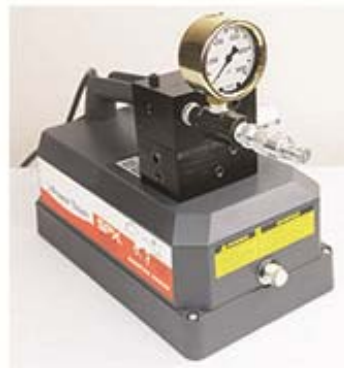
Electric / Pneumatic hydraulic pump equipped with "remote" footswitch. Standard voltage: 120 V. European voltage available.